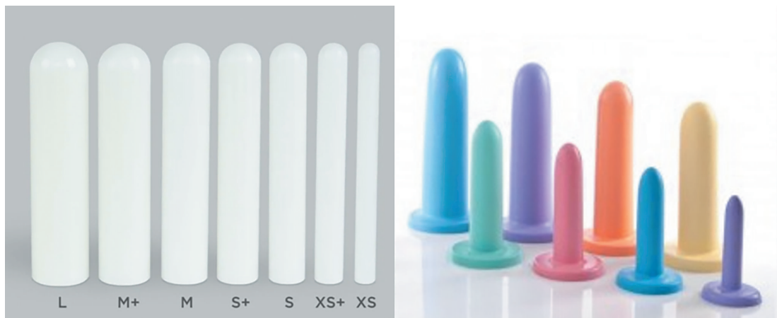
Figure 3. Examples of silicone and hard plastic vaginal dilators in different sizes.

which can lead to dyspareunia and vaginismus symptoms.